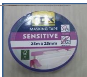
Foto a articolului Picture of the item

Obiectul descris este în conformitate cu legislația relevantă de armonizare a Uniunii: